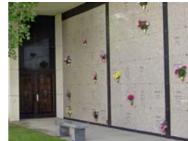
◀ photo: exterior crypts

Catholic Cemeteries reserves the right to remove any decorations that we consider inappropriate, do not conform to the guidelines, or may cause damage to the mausoleum or injury to our visitors or maintenance personnel.