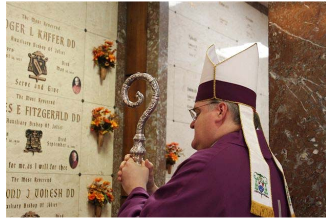
Resurrection Mausoleum Bishop crypts

Please do not disturb the decorations of others as they hold a special meaning to them and their family whose loved ones are remembered here.