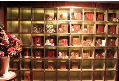
◀ Interior Glass Front Cremation Niches

If your loved ones site needs attention: or if you need to order lettering or engraving, please visit our office or call us for assistance 815.886.0750