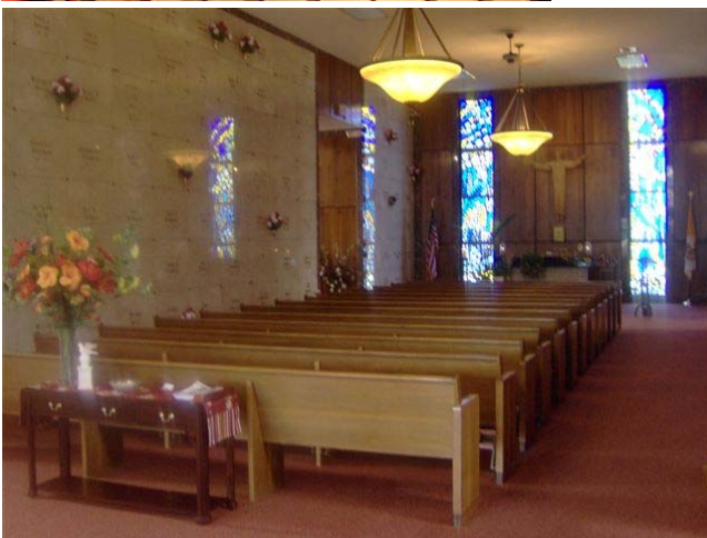
Chapel Mausoleum & Crypts ▼