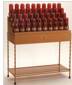
Image of Votive Stand