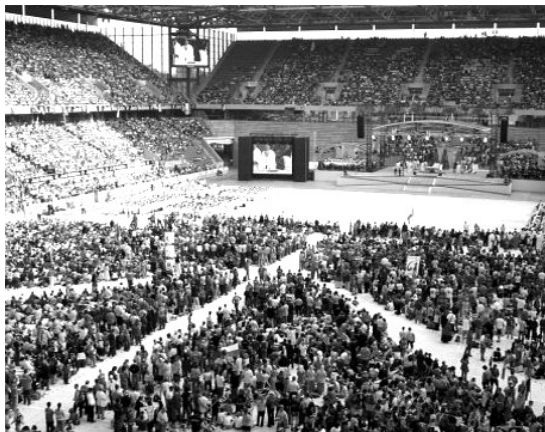
World Youth Day opening mass in Cologne Germany August, 2005 More pictures from Germany are available on http://www.dioceseofjoliet.org/